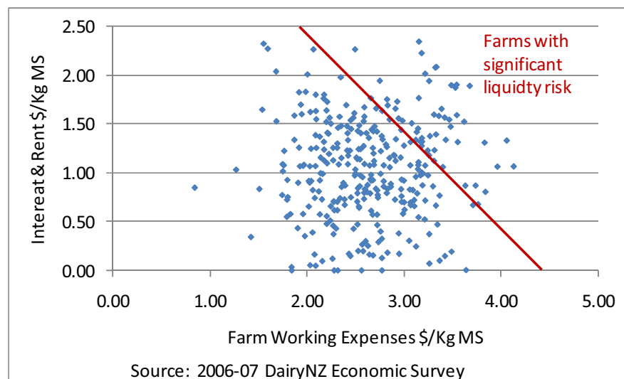
Figure 3. 2006-07 NZ Owner-Operators Interest & Rent/Kg MS vs FWE/Kg MS

Figure 3 shows the distribution of Owner-operator farms with FWE and Interest & rent/Kg MS in 2006-07. 11% of farmers were paying more than $4.50/Kg MS on these two key cash items, in a year when milk payments received averaged around $4.15 plus a further $0.30 in other cash income, i.e. close to $4.50 net cash income from dairy farming.